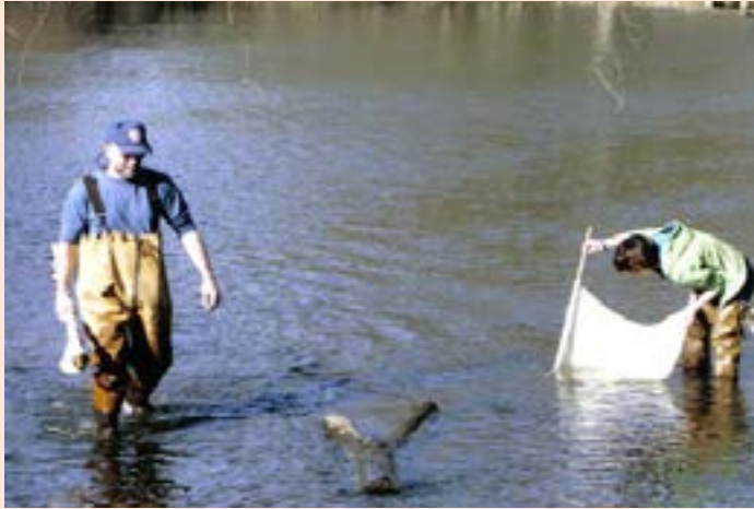
Performing a Biological Stream Assessment is a great way for your troop to get their feet wet!